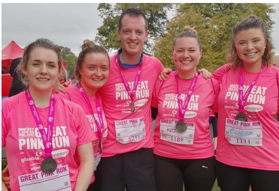
The Great Pink Run in aid of Breast Cancer Ireland