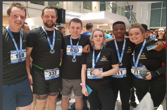
Sandyford 5k Run co ordinated by Sandyford Business District for well-being week