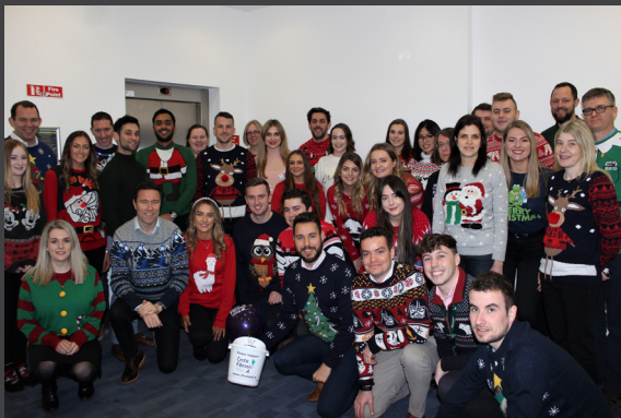
Christmas Jumper Day in aid of Cystic Fibrosis Ireland