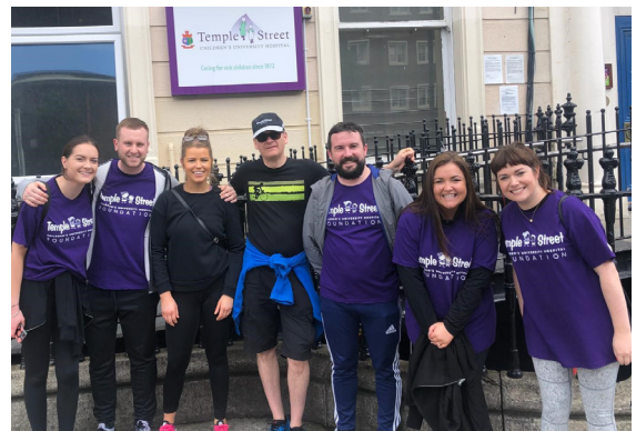
Techies4TempleStreet charity walk

We strive to embed best in class CSR practices into our entire business operations in an impactful, measurable and sustainable manner.