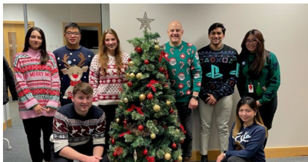
Christmas Jumper Day