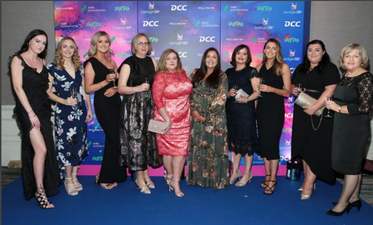
Staff attending the annual LauraLynn Heroes Ball

EisnerAmper was proud to announce our Corporate Partnership with LauraLynn Children's Hospice for a third year running in 2022. EisnerAmper Ireland partnered with LauraLynn, helping them to fundraise and support children and their families from all 26 counties with the aim of enhancing the quality of life for families in their care.