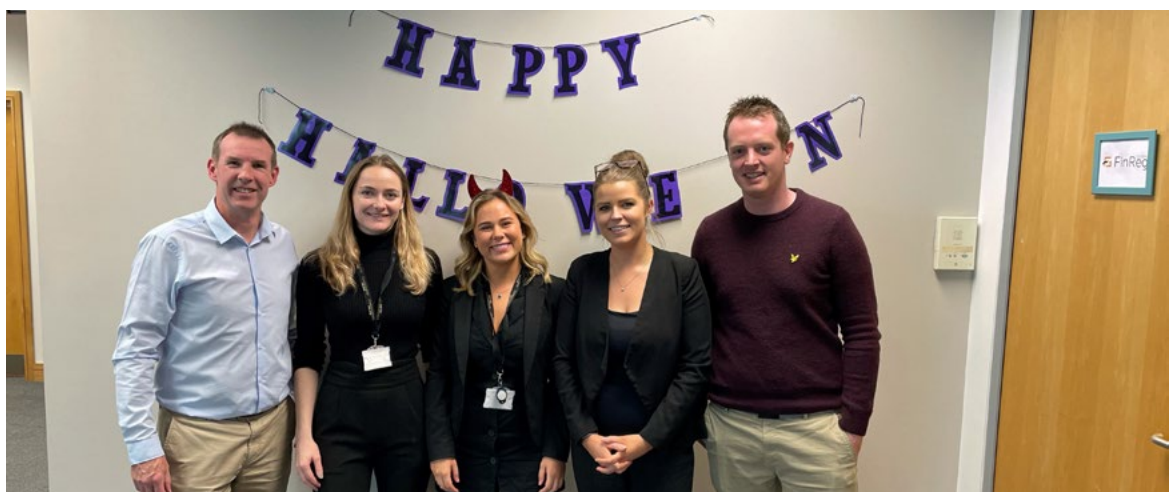
Halloween Quiz in aid of LauraLynn

Corporate Social Responsibility (CSR) is integral to how we do business and manage interactions, not just with our employees and clients but also our wider community and society as a whole. As a professional services Firm, demonstrating ethical high performance in all aspects of our work and how we run our Firm is fundamental to our success.