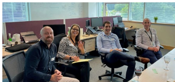
Staff quiz in aid of The Red Cross Appeal for Ukraine

We would like to thank all of our staff for helping us give back over €20,000 to various charities during 2022.