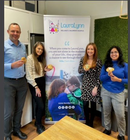
Staff participating in a coffee morning in aid of LauraLynn